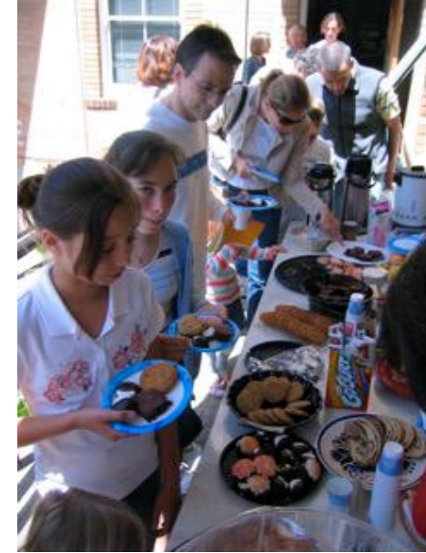
born 1995 in Oakland